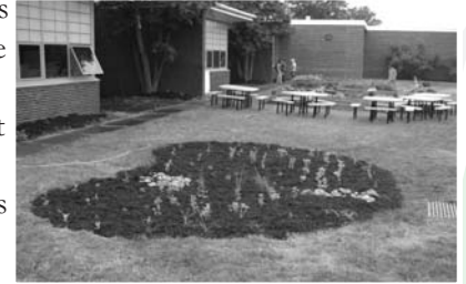
Vanderveer School Rain Garden

Recently completed was a “Rain Garden” at Somerville’s Vanderveer Elementary School on Union Avenue. The school is participating in NJWSA’s “River-Friendly Business” program, under which the school receives guidance and technical assistance to help them protect and improve water resources. The program also provides an opportunity to educate faculty, staff, students, and the community about actions that can be taken to protect water resources in the watershed where they live, work and play.