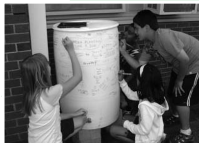
Vanderveer School Rain Barrel

At the request of the NJWSA, the Somerset County Park Commission provided a backhoe and operator and some much-needed labor to create the Rain Garden. Vanderveer is the first public elementary school in the area to register for the “River Friendly Business Certification Program” administered by the New Jersey Water Supply Authority.