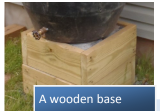
A wooden base