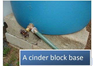
A cinder block base

Tip: While the base does not need to be elevated, a raised platform will allow you to use a watering can and the spigot will be easier to access.